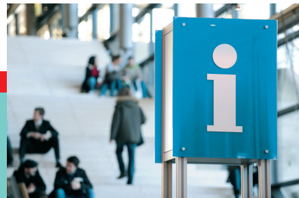
Exhibition Ground, Hanover

Participation is possible for selected modules as well as the entire seminar. The International Seminar will take place on the 24 th and 25 th of October 2012 at the Convention Centre of the Hanover Exhibition Centre ( www.messe.de/homepage_e ).