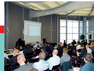
Successful chs 2 seminar at EuroBLECH 2010.