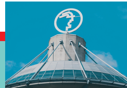
Convention Centre, Hanover