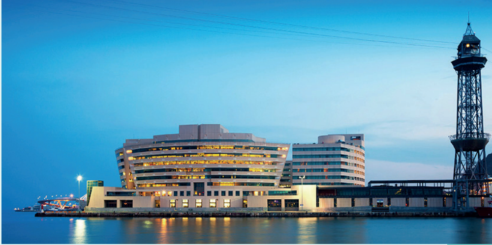
WTCB Business Complex

For the first time, the CHS 2 conference will be held in Barcelona, Spain, May 31 st – June 3 rd , 2021, at World Trade Center Barcelona.