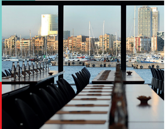
Port Vell Room. WTCB